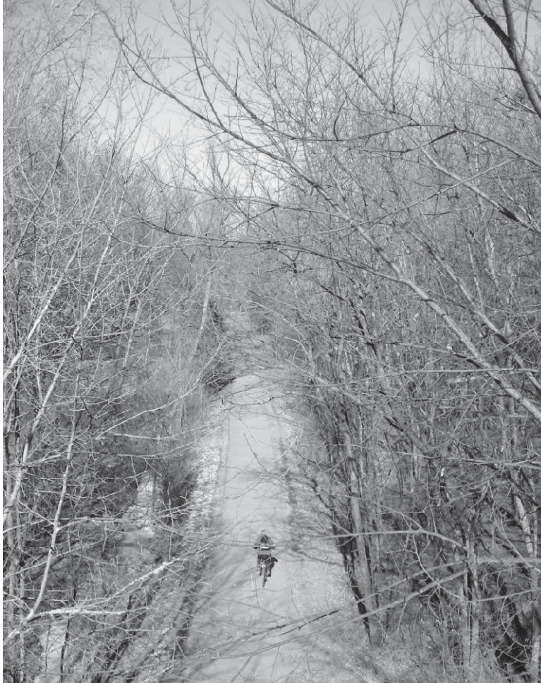
FIG. 2.—One of five urban forest corridors sampled along a bike trail in Lincoln, Nebraska

and Siberian elm ( Ulmus pumila ); however, a few samples could not be identified to species. The non-native, low-growing shrub wintercreeper ( Euonymus fortunei ) was observed in sites 1, 2 and 3 but was not recorded in the samples.